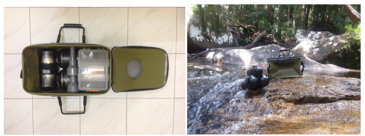
Figure 1.0: The Capsule Hydro Twin-Turbine (CaHT) and The CaHT on display